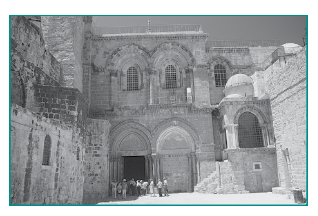
The Church of the Holy Sepulchre in Jerusalem. Ancient tradition places this location as the site of Jesus's death, burial, and resurrection.

The women had seen Jesus's crucifixion and had noted the place where He was buried (Luke 23:44-56). The fact that they were headed to the tomb to anoint His body highlights the fact that they didn't expect the tomb to be empty, even though Jesus had taught them about His resurrection multiple times.