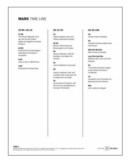
Example from Explore the Bible Leader Pack

Locate a study Bible with a time line of the major people and events related to the book of Mark.